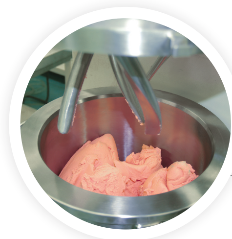
↑ Figure 1. Double planetary mixer with helical high-viscosity (“HV”) blades designed for materials up to around 6 million centipoise (U.S. Patent No. 6,652,137).