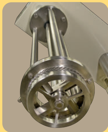
The PreMax with a Delta generator operates with a tip speed of 5,000 fpm and handles viscosity up to 50,000 cP.