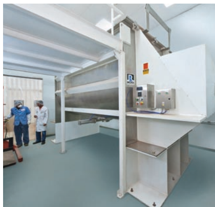
This 385-cu-ft sanitary ribbon blender currently processes green food powders, along with chocolate and red berry powders, in long production runs. Downstream from the blender, Bactolac ships these products in a wide variety of packages, from 30-gal drums to jars, bottles, and pouches.

Meanwhile, the overlapping capacities of the new blender, and two others in the plant, reflect the prevalence of mid-sized orders today. (See Table 1.) Orders between 36 and 80 cu ft—a broad range that includes the bulk of Bactolac’s production runs today—can be blended in either the company’s 80-cu-ft blender or its 120-cu-ft blender. Similarly, orders between 115.5 and 120 cu ft can be as-